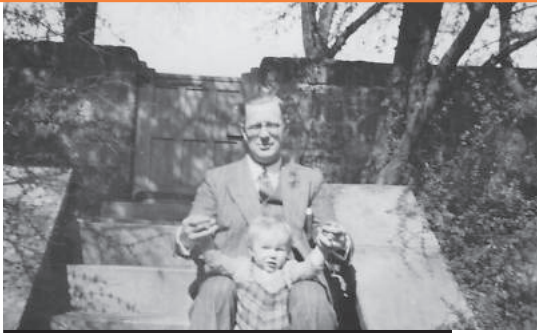
With her father in Southbank's back garden