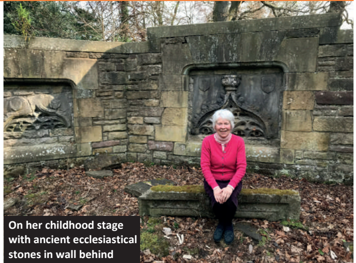
On her childhood stage with ancient ecclesiastical stones in wall behind