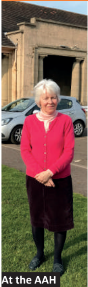
At the AAH