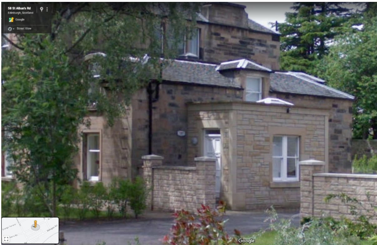
60A St Alban's Road EH9 2LX – Google streetview, June 2008

This application is for a dormer with roof terrace, together with relocation of the front door. While we do not object to the relocation of the door, we do object to the proposed form and materials of the window that will replace the door. The fenestration of the villas, of which this flat forms a part, is consistent in its principal elevation in having 1-over-1 sash and case white-painted timber windows.