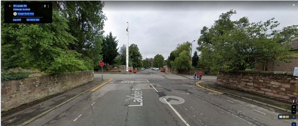
Application site at Lauder Road / Grange Road, looking North. (Proposed mast superimposed)

We note the recent refusal of similar applications 23/01490/FUL and 22/04200/FUL on Whitehouse Loan, also in a conservation area. In the Handling Report for the former application, explaining the refusal, the Case Officer wrote: